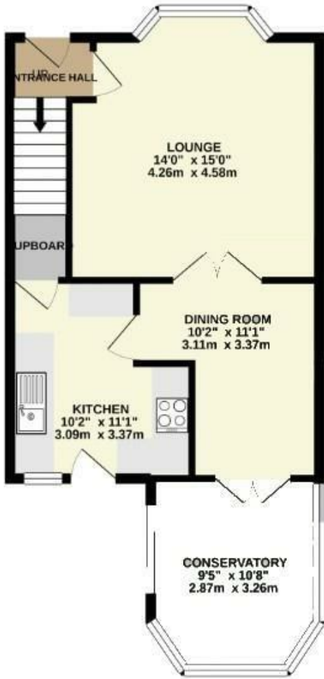
GROUND FLOOR 530 sq. ft. (49.2 sq. m.) approx.